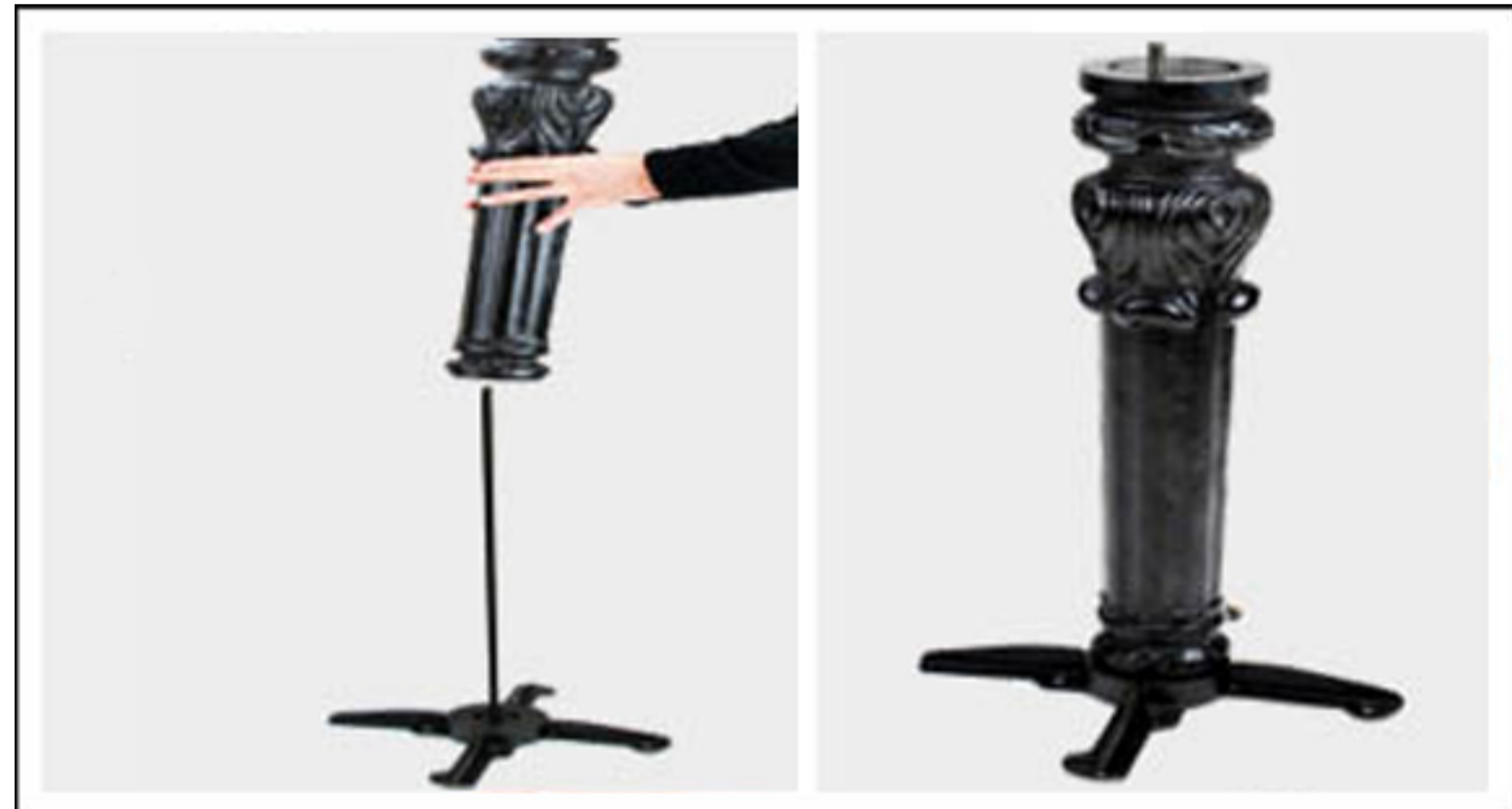
3. PLACE COLUMN OVER ROD