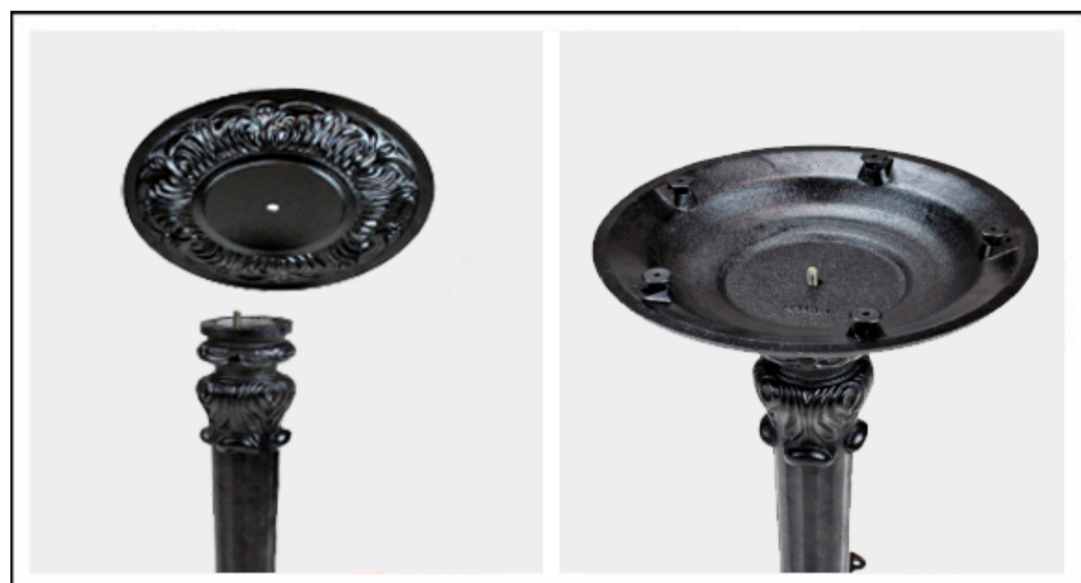
5. FLIP BASE UPSIDE DOWN AND GUIDE ROD THROUGH BASE'S CENTER HOLE