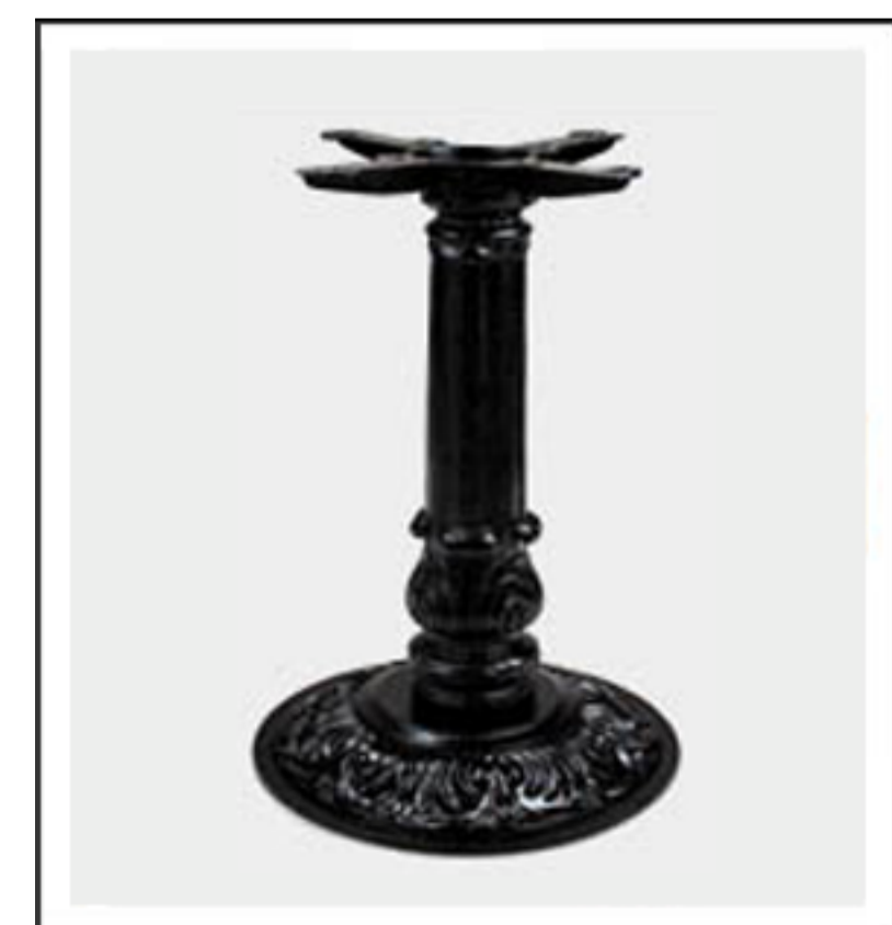
7. FLIP OVER FOR FINISHED PRODUCT.