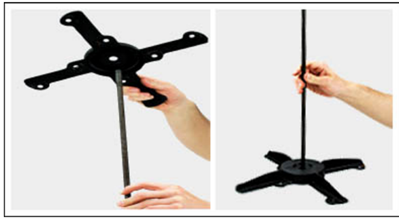
1. SLIDE ROD THROUGH TOP OF SPIDER