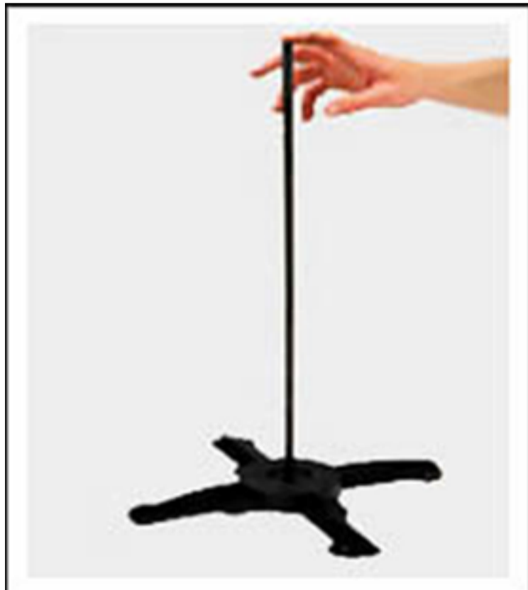
2. FLIP SPIDER AND ROD UPSIDE DOWN, THREADED END OF ROD SHOULD FACE UP