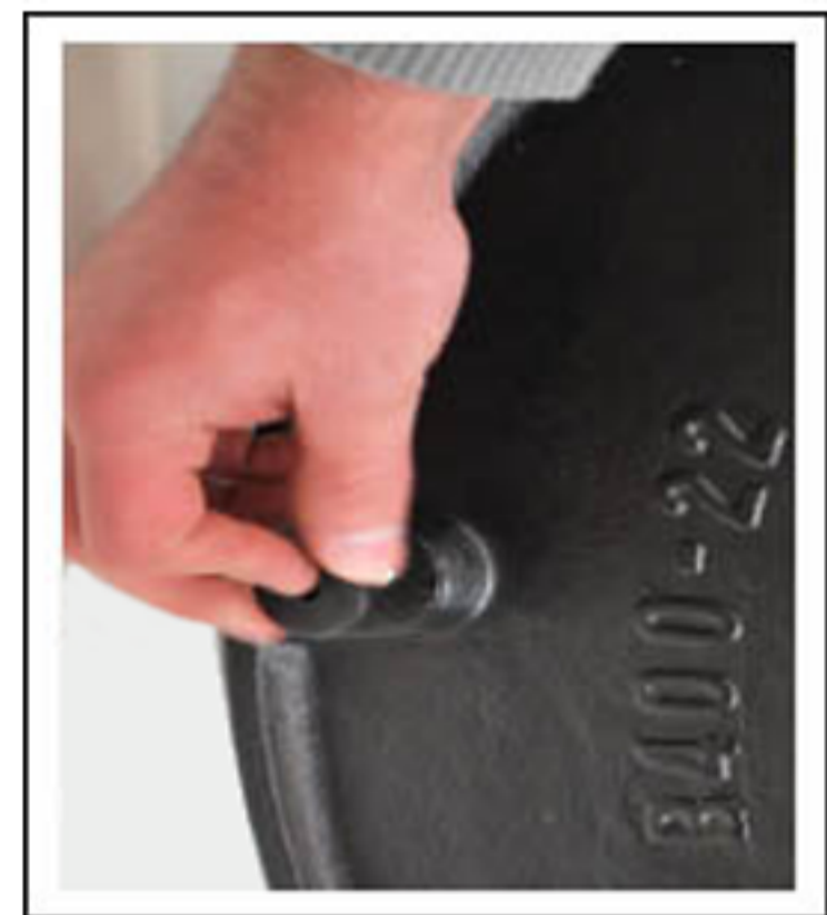
4. SCREW GLIDES INTO BOTTOM OF BASE